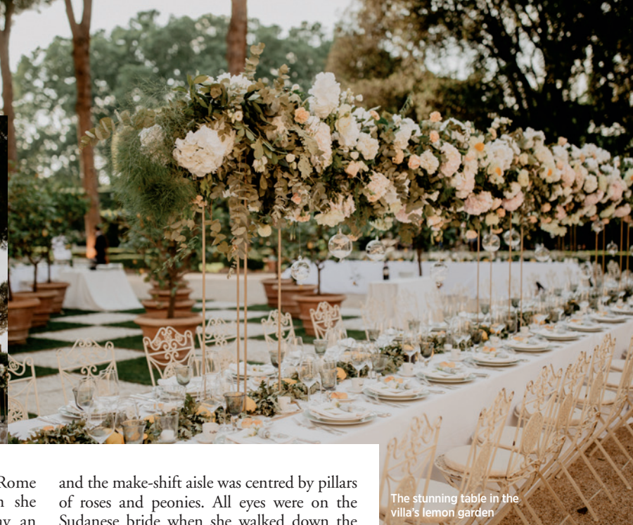
The stunning table in the villa's lemon garden