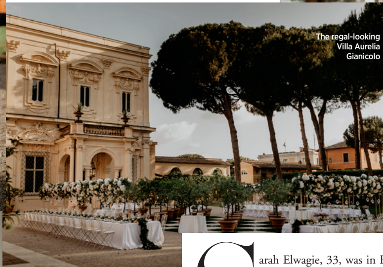
The regal-looking Villa Aurelia Gianicolo