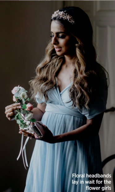
Floral headbands lay in wait for the flower girls