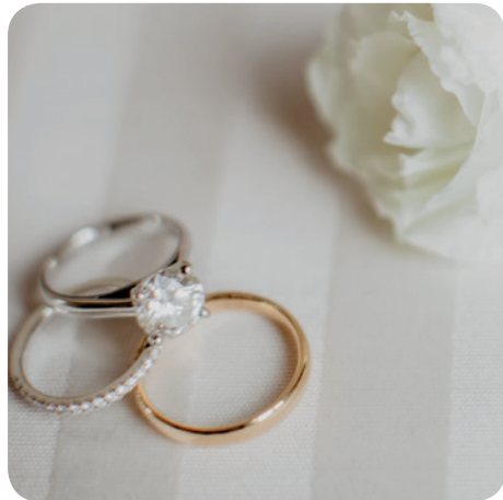
The bride's solitaire engagement ring and wedding bands were from Stargems