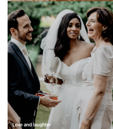
Love and laughter