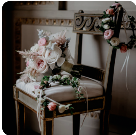
The bridal bouquet of blush pink roses and peonies