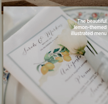
The beautiful lemon-themed illustrated menu