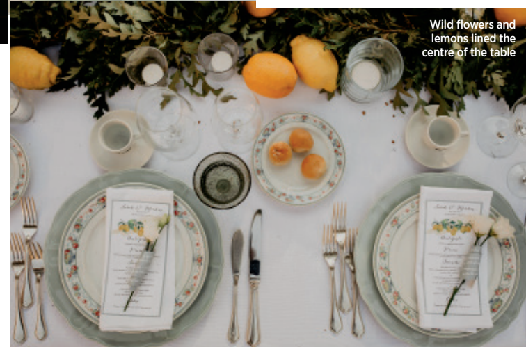
Wild flowers and lemons lined the centre of the table